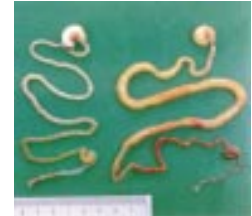
See p 355