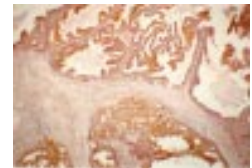
See p 361