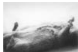
See p 387