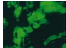
See p 558