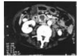
See p 549