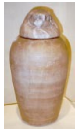
See p 886