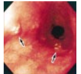
See p 281