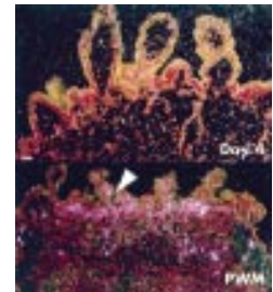
See p 540