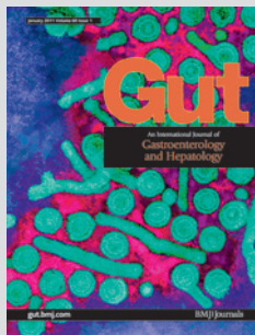
Cover caption: Hepatitis B viruses, coloured transmission electron micrograph (TEM). They are a cause of liver inflammation. The smaller circles and the rod-shaped objects are surplus viral coat (capsid) protein from infected liver cells. These non-infectious antigens (foreign proteins) are used to make vaccines against hepatitis B. The complete viruses are called Dane particles. Hepatitis B is transmitted by infected blood, passed mainly through sexual intercourse or the sharing of needles by intravenous drug users. Symptoms include headache, fever, weakness and jaundice. Magnification unknown.

Journal of the British Society of Gastroenterology