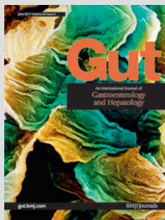
Cover: Oesophagus epithelium. Coloured scanning electron micrograph (SEM) of the epithelium (lining) of the oesophagus. The irregularly-shaped epithelial cells (blue & yellow) have a highly folded surface. These tiny folds are called microvillae. The flattened cells form a stratified squamous epithelium many layers thick. As a muscular non-absorptive tube, the oesophagus transports swallowed food to the stomach. The microvillae keep the oesophagus moist, trap mucus to lubricate passing food and protect the epithelium from food abrasion. Magnification unknown.

An international journal of gastroenterology and hepatology